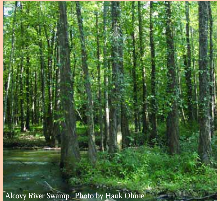
Alcovy River Swamp.

C.T. Lyles, Junior Bass Busters volunteer, deploys rolls of aluminum flashing to reinstall drift fences for wildlife research.