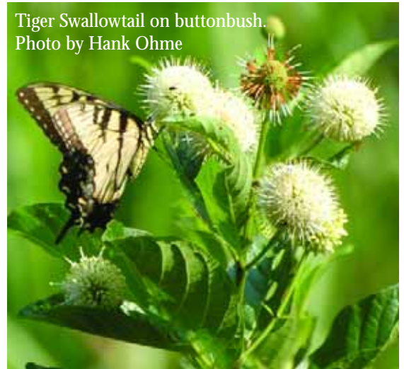
Tiger Swallowtail on buttonbush.

Anyone can create wildlife habitat in their own backyard by providing wildlife with food, water, cover and a place to raise their young. To learn more about backyard habitat visit our website at www.gwf.org . 🍁