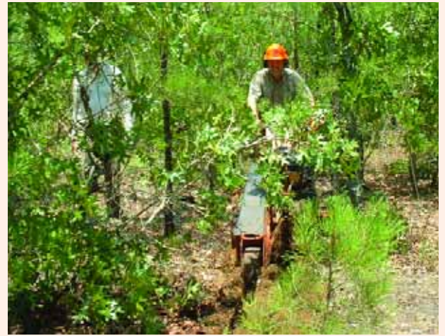
DNR staffer Nathan Klaus guides a trencher, the first step to reconstructing drift fences.

Drift fences allow DNR to study the movements and population trends of reptiles and amphibians. Stretches of aluminum fencing are installed in a cross pattern with pit traps located in the center and at each end of the cross. When reptiles and amphibians encounter the drift fence they are forced to change their course and fall into the pit traps. DNR checks the traps daily, recording and then releasing their "catches." TWW members worked with DNR to remove the old fences and install new fences. Groups participating in this project included Junior Bass Busters, Georgia Chapter of the Bass Federation, Georgia Chapter of the Sierra Club, Macon College and Georgia Wildlife Federation. 🍄