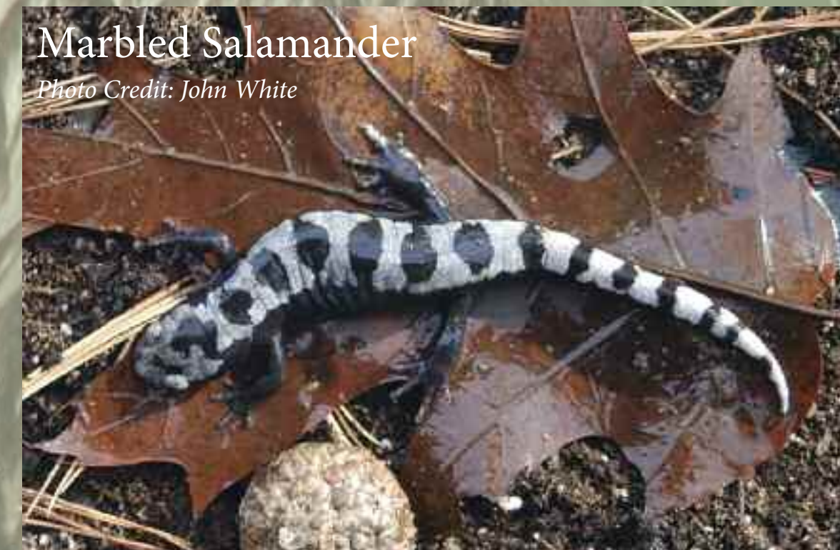
Marbled Salamander