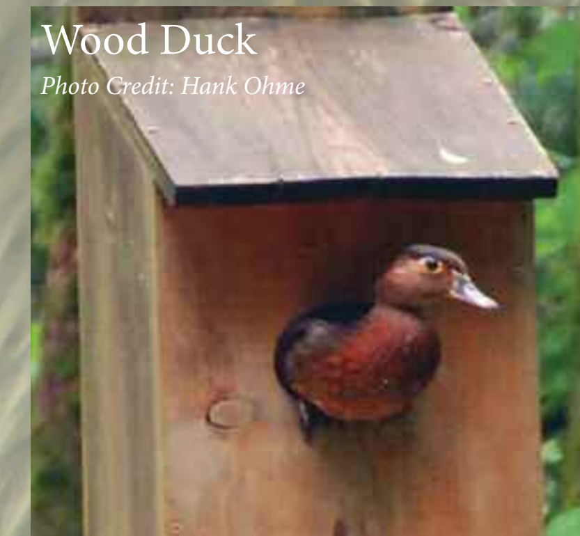
Wood Duck