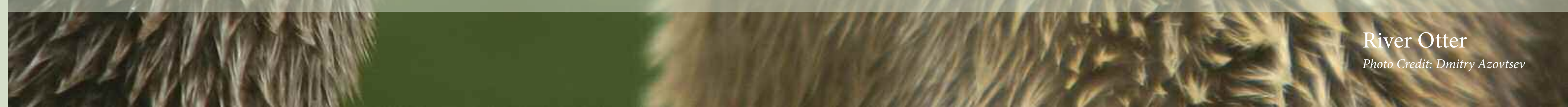
River Otter