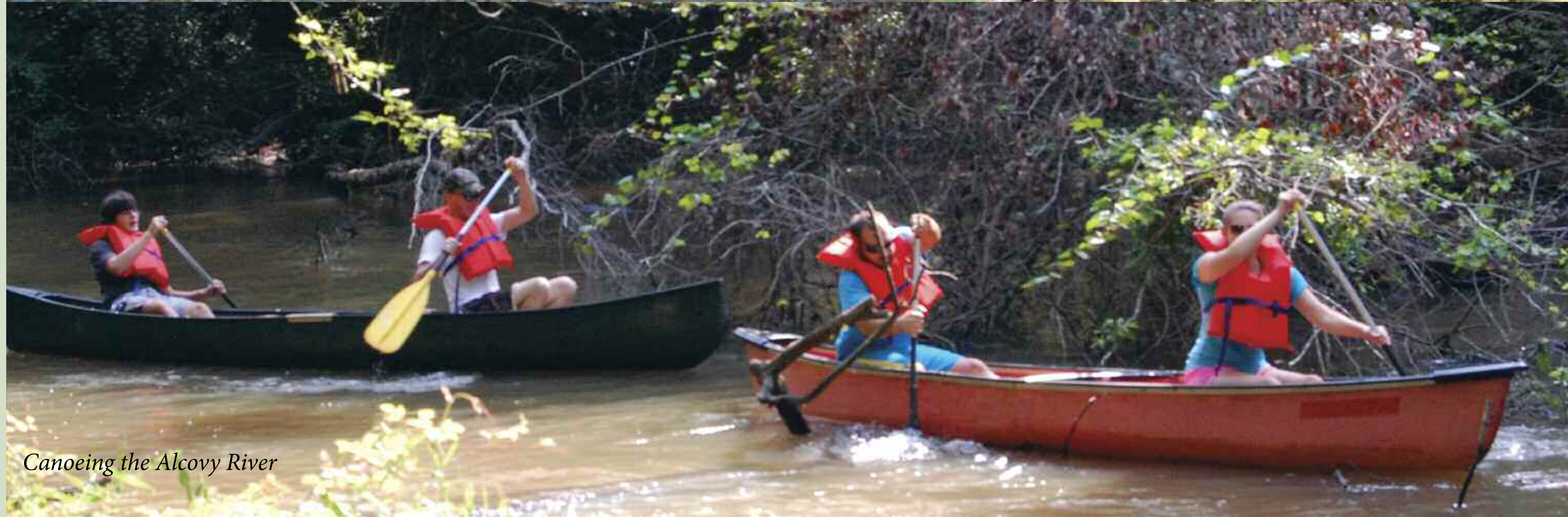
Canoeing the Alcovy River